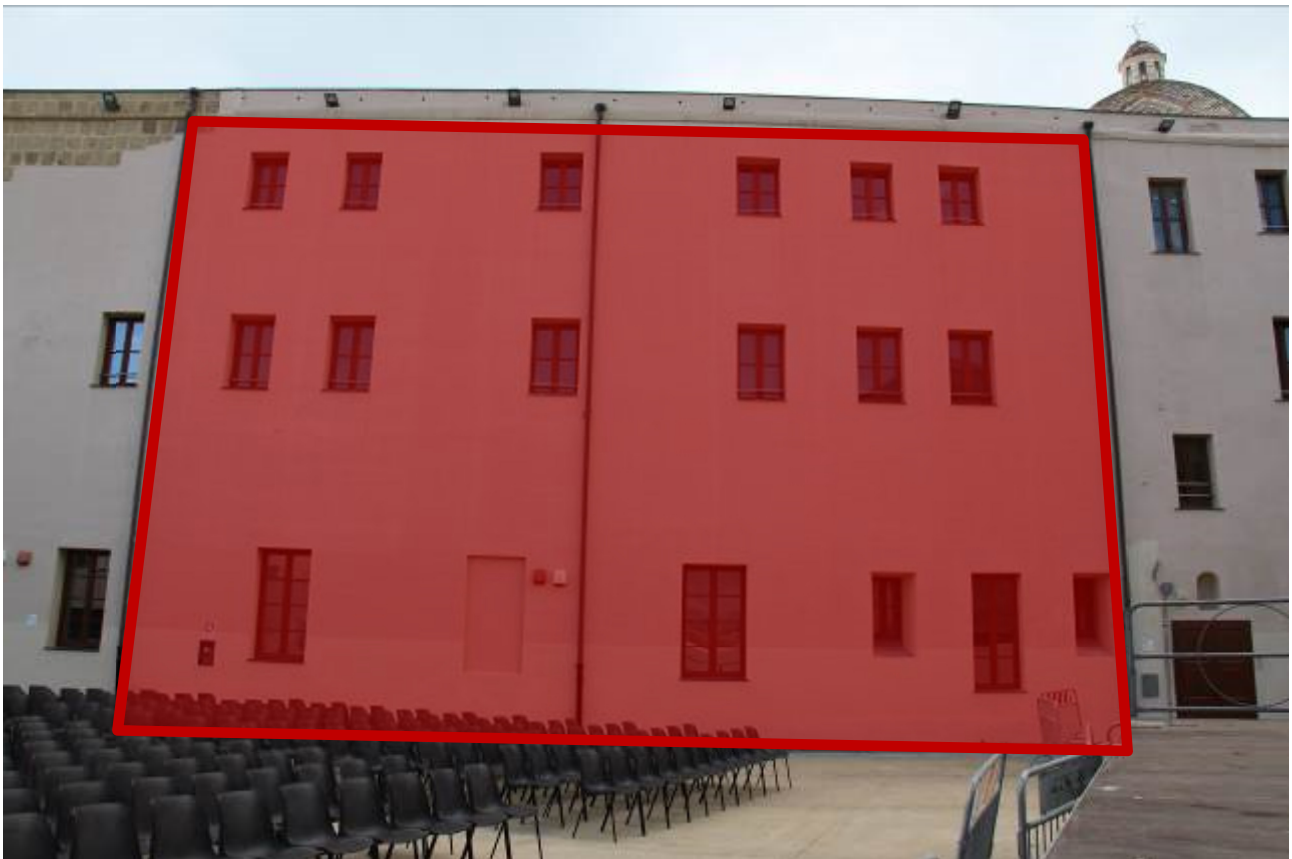
Figura 3. Layout videomapping - Lo Quarter Square

Italy ★ Egypt ★ Jordan ★ Lebanon ★ Palestine ★ Spain ★ Tunisia