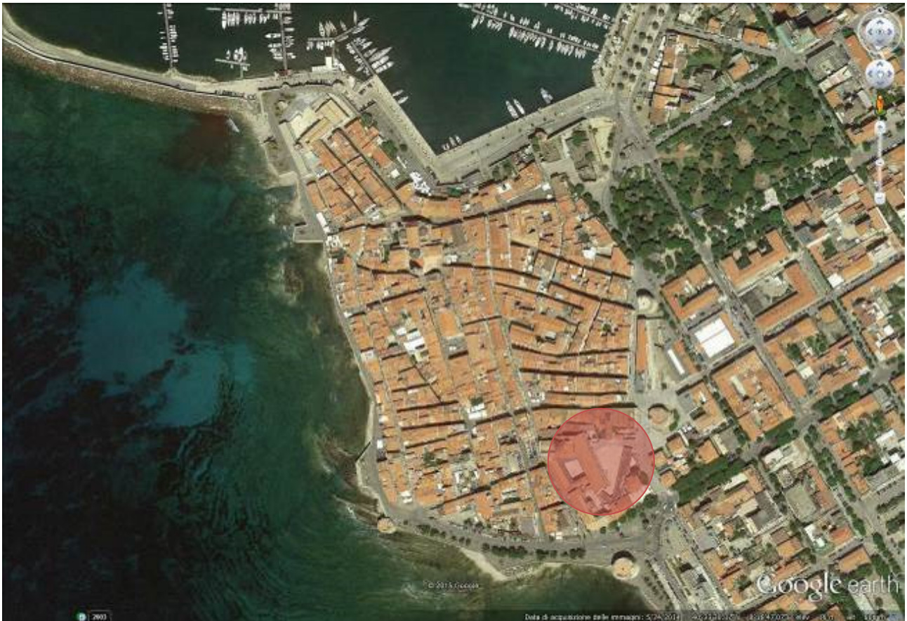
Fig. 1. Area of intervention

The area of intervention is located in the historic city centre of Alghero and it is indicated in the picture below.