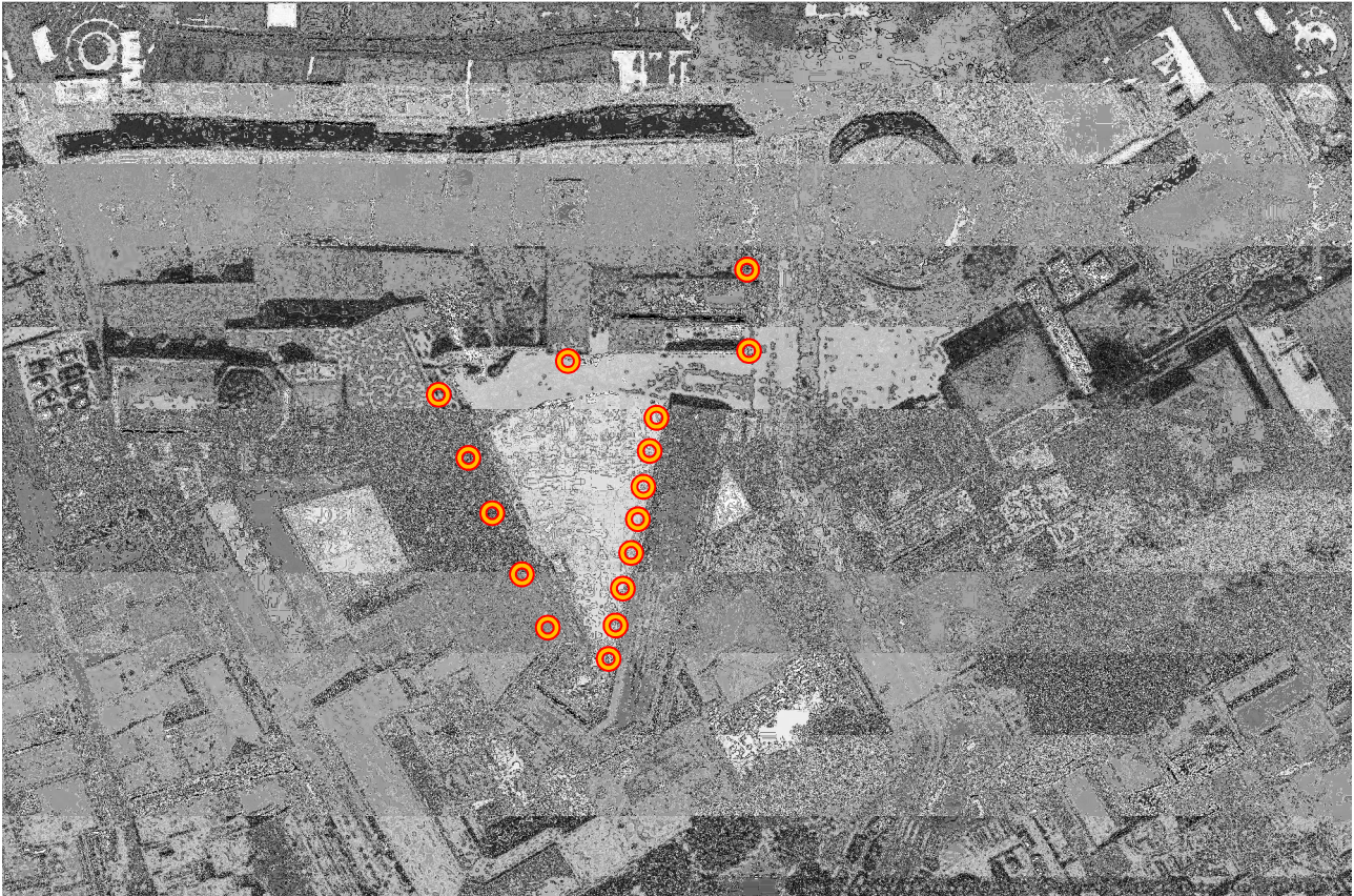
Figura 3. Spots of public lighting

In the area there are the following spots of public lighting that the Municipality of Alghero will turn off during the hours of representation mentioned above.