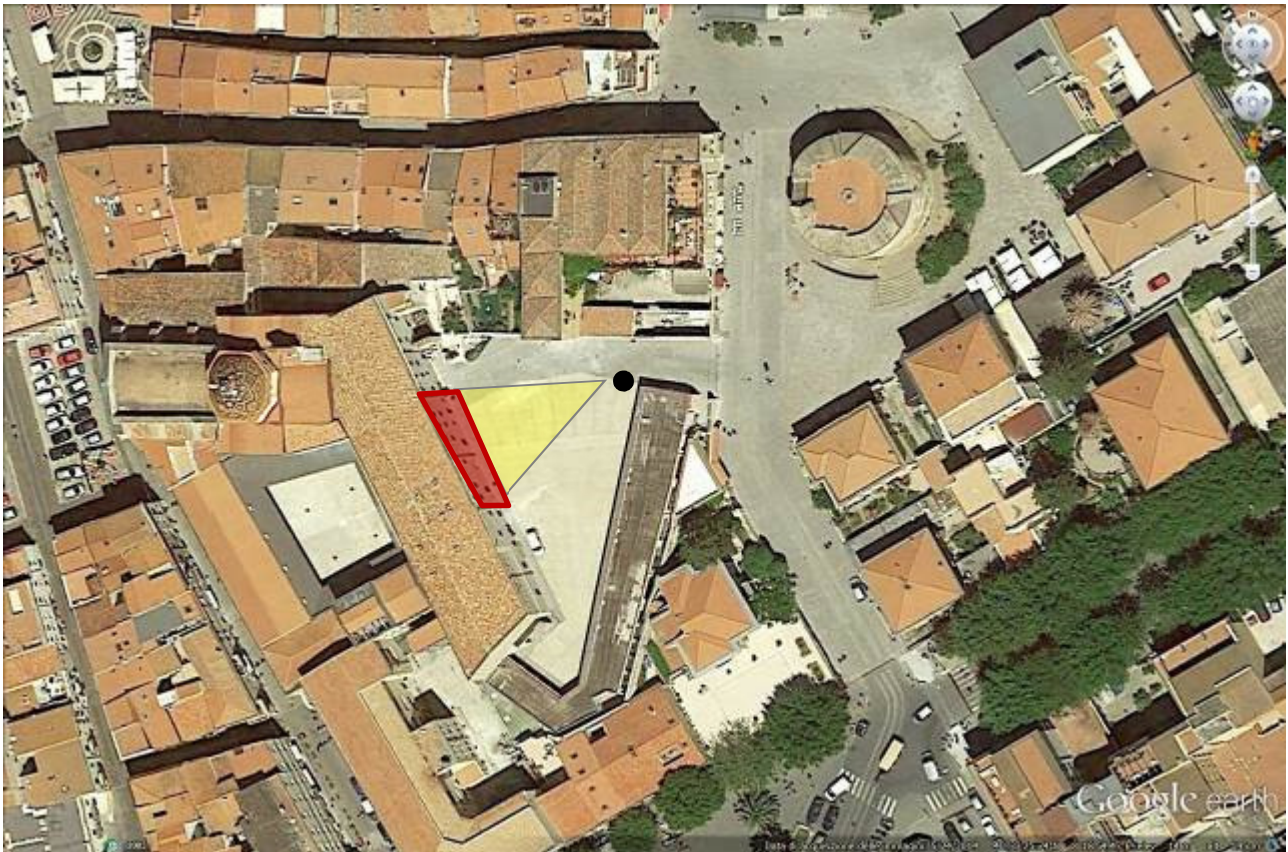
Figura 2. Lo Quarter square

The videomapping show will be projected on the 25 th and 26 th of September 2015, roughly from 8:00 to 00:00 pm.